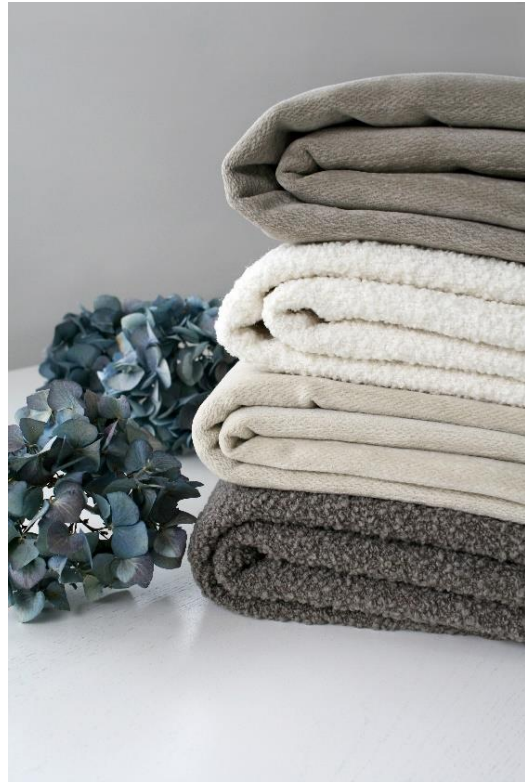
left: Rune, Charlie, right: Charlie, Palermo

Our closeness to nature, however, goes beyond merely viewing it as a source of inspiration. The Scandinavian approach to protecting our environment and resources determines all of our daily business – from fabrics made from recycled materials and green electricity to halving our paper consumption over the past two years. These are just some of the many ways we consciously put the environment front and centre – so we can also enjoy the inspiration of nature in the days to come.