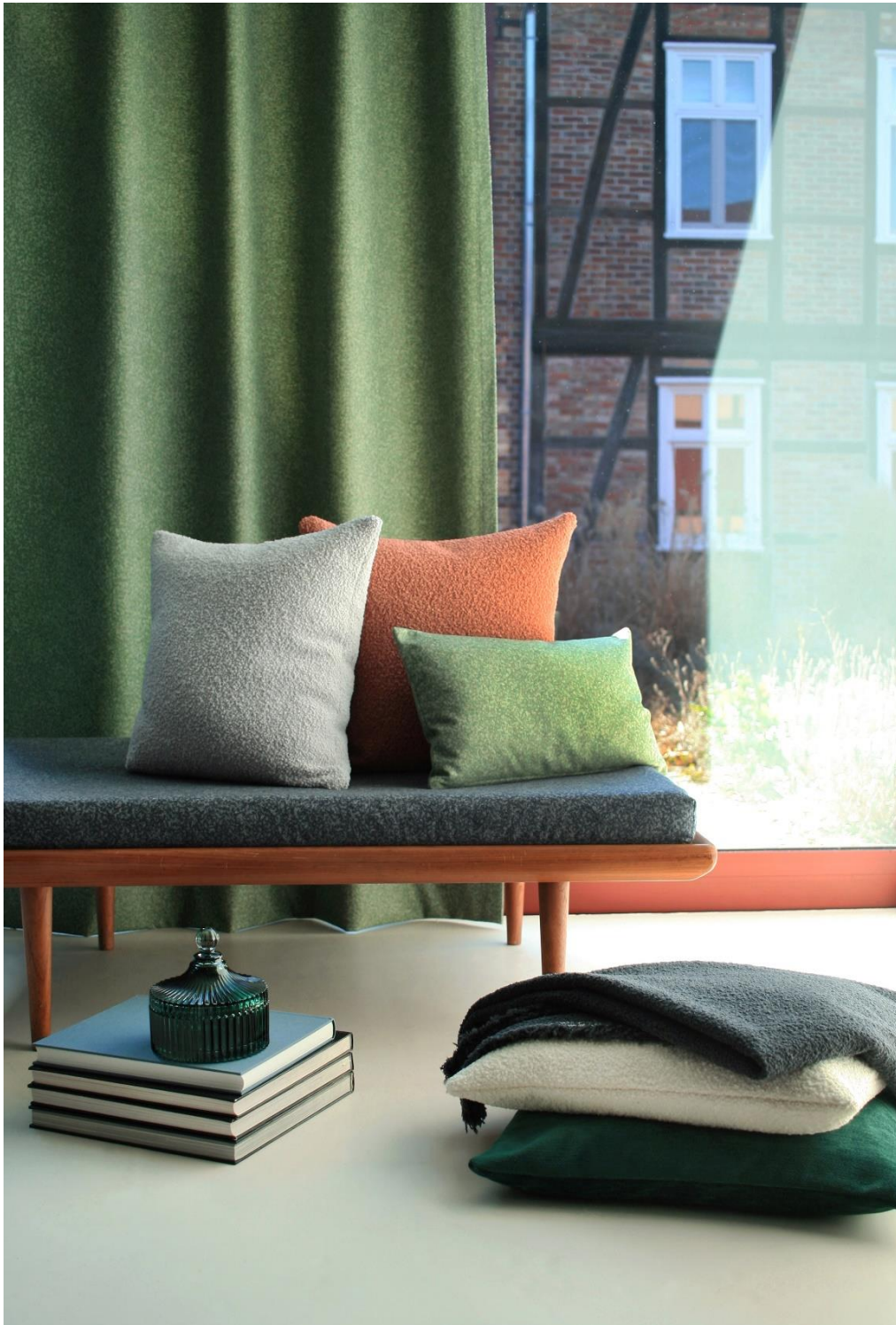
Rune (Curtain, upholstery), Charlie (Cushions, Plaid), Palermo (Cushions)