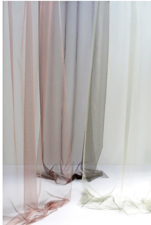
left: Marlene CS, right: Alva FR

Tender clematis blossoms find their textile counterparts in Alva FR 's soft-hued transparency and the curved filigree lines of Marlene CS , subtly complemented by Chelsea shimmering like dew drops. Fleecy soft moss serves as nature's template for exciting textures with a woolly touch as embodied by tactile delights such as bouclé Charlie or the organic patterns of Rune , that appeal to both the eye and fingertips. Firmly rooted in the earth, heather determines the scenery without pushing to the fore – just like those natural basics Jonte , Jona and Scarlet , proving with their informal tabby weave and elegant satin just how multi-faceted linen is.